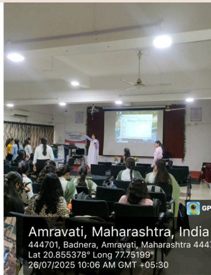
Amravati, Maharashtra, India 444701, Badnera, Amravati, Maharashtra 4447 Lat 20.855378° Long 77.75199° 26/07/2025 10:06 AM GMT +05:30