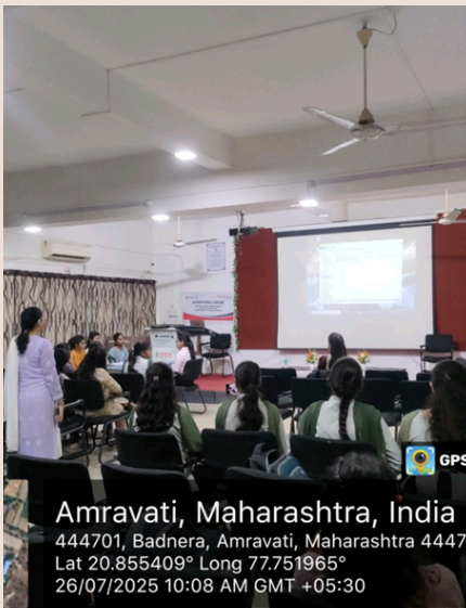
Amravati, Maharashtra, India 444701, Badnera, Amravati, Maharashtra 4447 Lat 20.855409° Long 77.751965° 26/07/2025 10:08 AM GMT +05:30

The workshop witnessed enthusiastic participation from girl students across all branches. Participants expressed that the sessions were engaging, insightful and transformative.