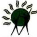
AGRICLINICS & AGRIBUSINESS CENTRES BETTER FARMING BY EVERY FARMER