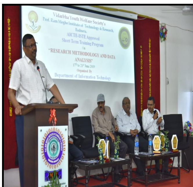
Presidential Speech by Hon. Yuvrajsingh Chaudhary