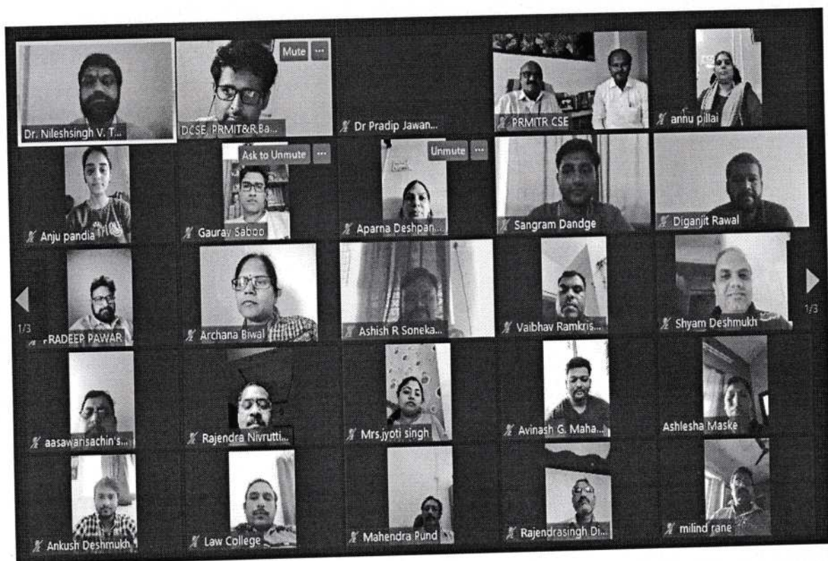
Online Snapshot of Photo during valedictory of One Week AICTE-ISTE approved STTP

An Online feedback was asked from participants and also a Quiz test was conducted on course content of STTP to assess the understanding of course concepts of participants. All participants provided their feedback and attended the quiz test conducted on last day of Short-Term Training Program.