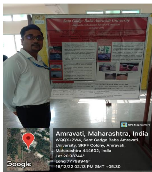
Glimpses of the University Level Avishkar event