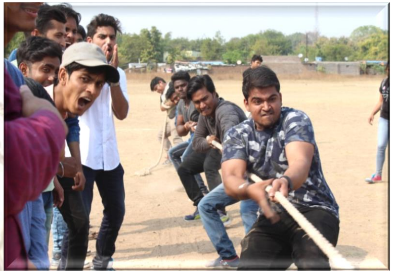
Students Playing Tug of War