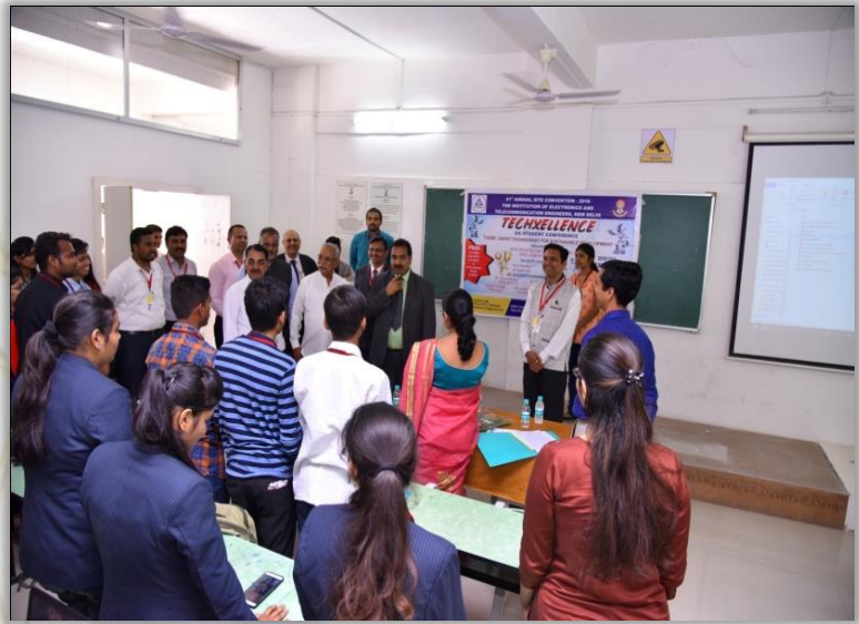
UG Students conference