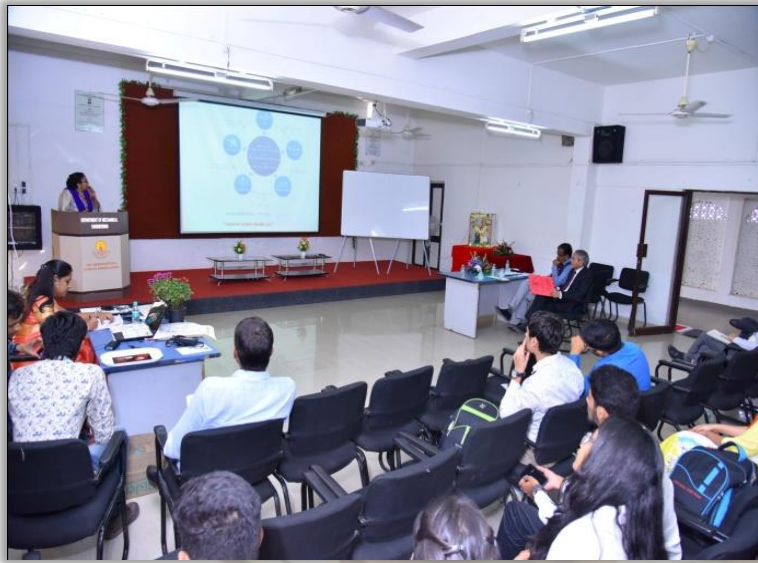
Technical Paper presentation sessions