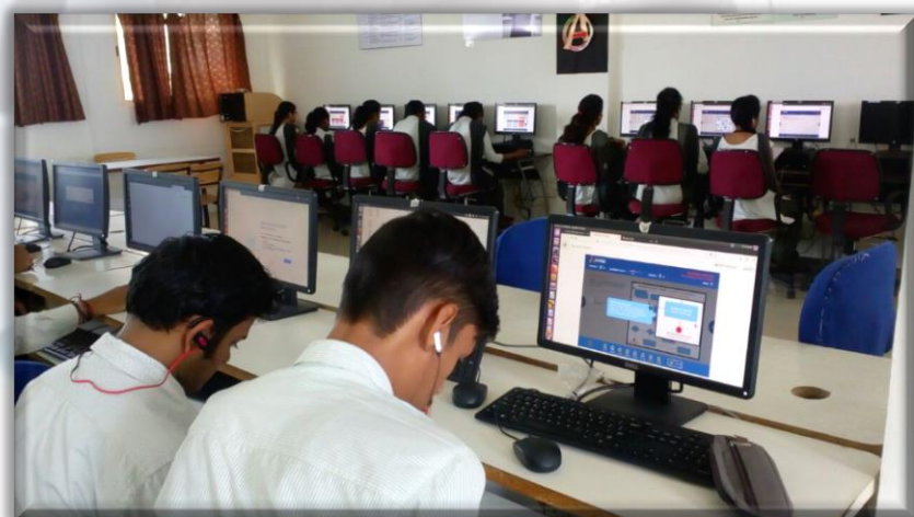
Students performing python workshop