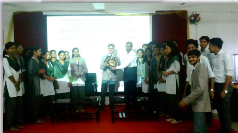
Trophy Distribution to the Winning Team

The Quiz competition was based on general as well technical topics. The rapid questions were asked to students and winner is finalized on the basis of highest marks. At the end of the program winners were declared of all competition and prizes were given to winners.