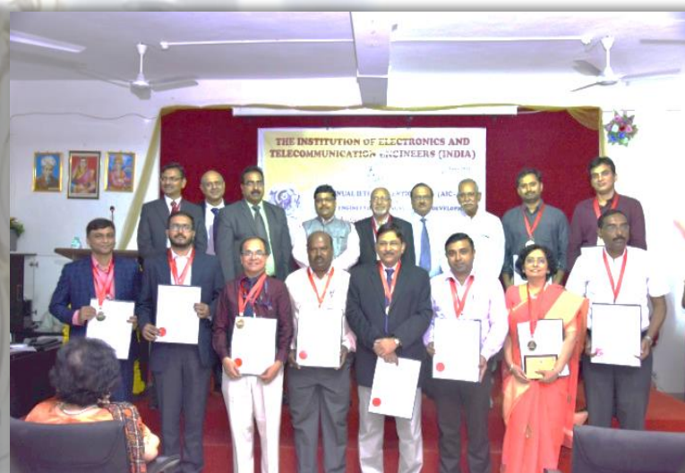
IETE awards to recognize excellence in scientific endeavor