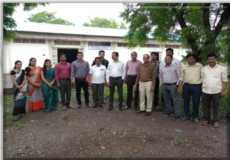
Tree Plantation & Cleaning activity by faculties