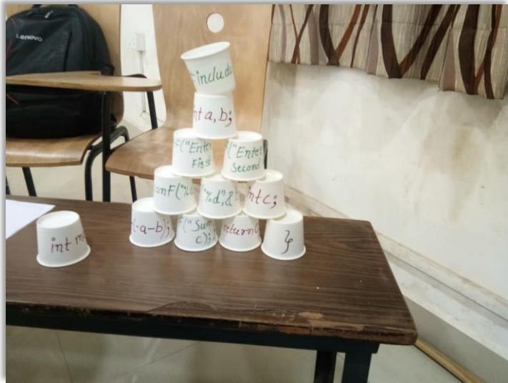
Code pyramid competition

In Sports students organized Box cricket in which 10 teams (7 members in each) were participated, Tug of war in which 15 teams (5 Members in each) were participated, Relay race in which 2 teams (4 members in each) contestants were participated.