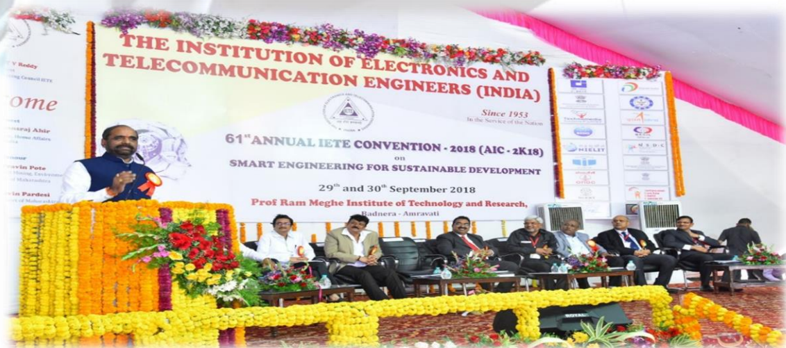
Hon. Shri. HansrajAhir addressing to gathering at Inaugural Function

Chief Guest of the inaugural function Hon'ble Shri HansrajAhir spoke about the United Nations Goals for Sustainable Development in which availability of Food, shelter, Health services and clean drinking water are on top priority. He also narrated the priorities of the Government on climate change and sustainability for future generations.