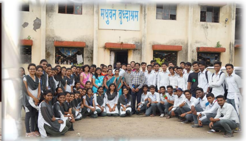
Visit at Old Age Home