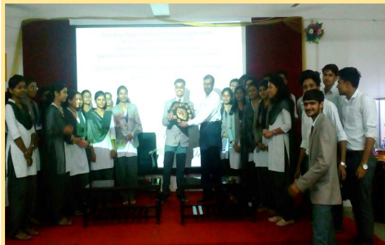
Trophy Distribution to the Winning Team

The Quiz competition was based on general as well technical topics. The rapid questions were asked to students and winner is finalized on the basis of highest marks. At the end of the program winners were declared of all competition and prizes were given to winners.