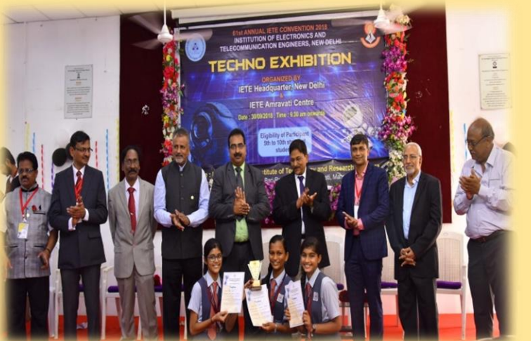
Project models competition for school students