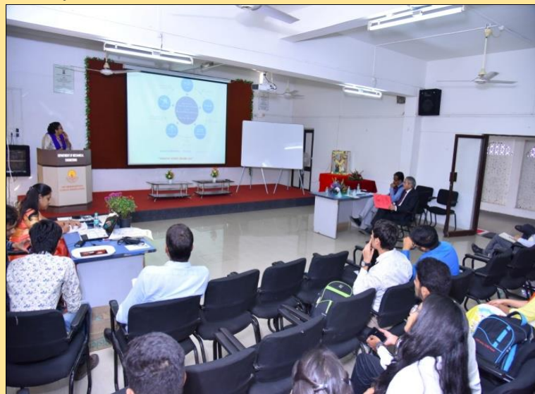
Technical Paper presentation sessions

Valedictory session consisted of conferment of wide range of IETE National level awards to recognize excellence in scientific endeavor.