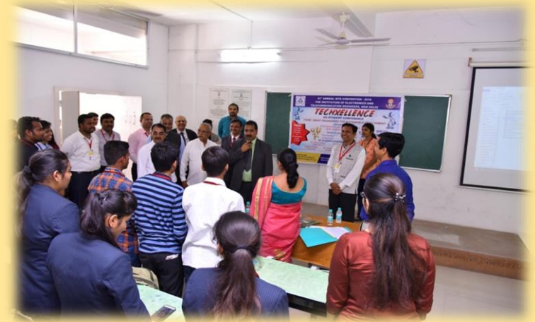
UG Students conference