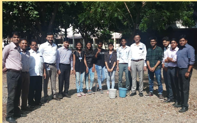
Cleaning Activity Done by Faculty & Students