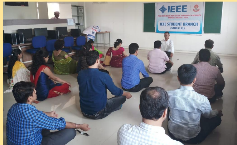
Yoga Day Celebration in Department

Regular practice of yoga will surely help faculties as well as students achieve a better life, physically, mentally and spiritually as well.