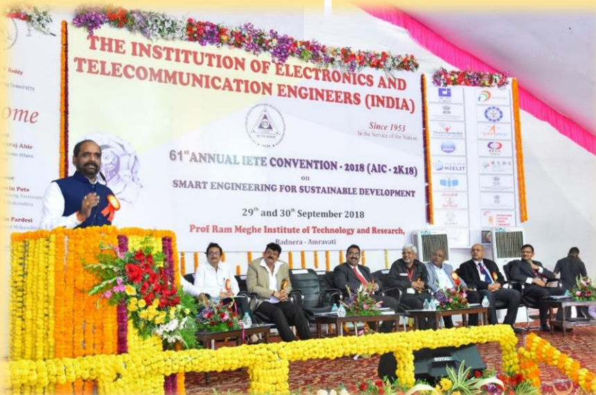
Hon. Shri. Hansraj Ahir addressing to gathering at Inaugural Function