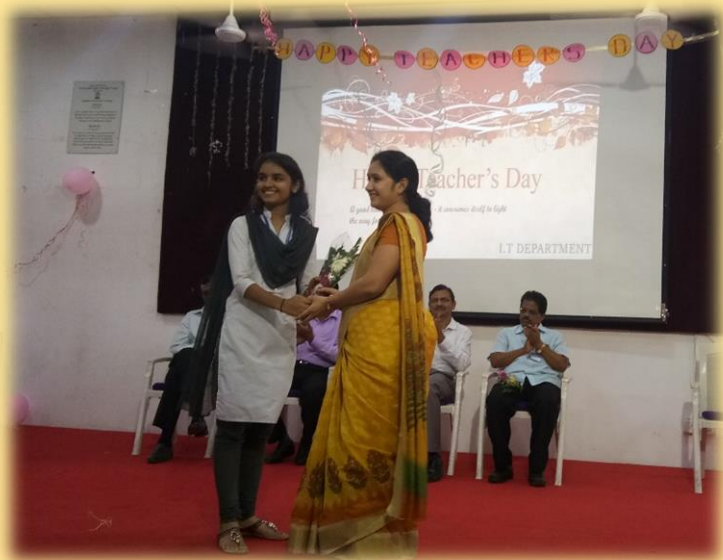
Felicitation of Faculty at the hands of Students