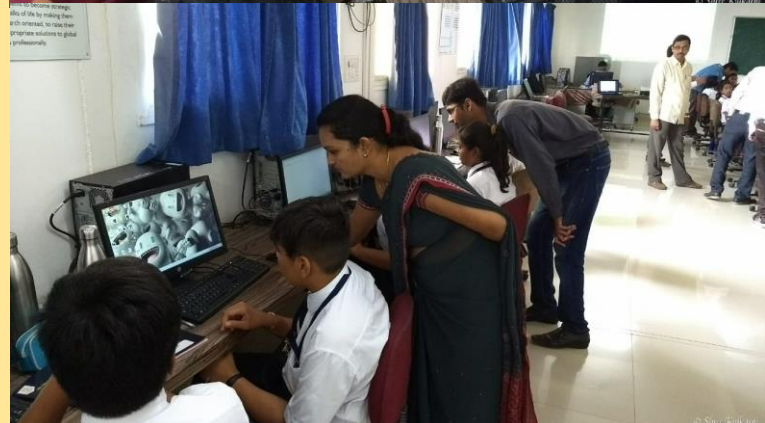
Faculty Gives the Information to the School Students