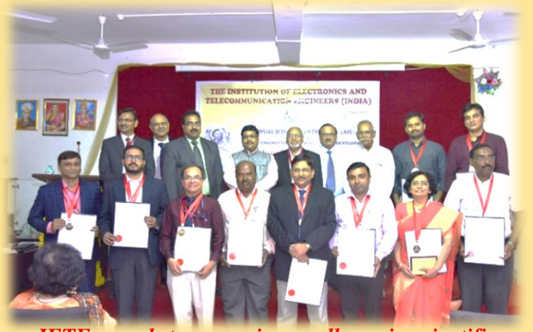
IETE awards to recognize excellence in scientific endeavor