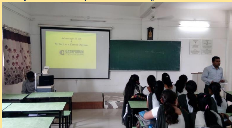
Guest Lecture Delivered by GATE Forum