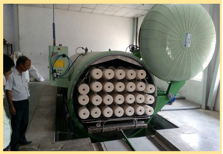
Turbine Section at Suryalakshmi Textile Pvt. Ltd.