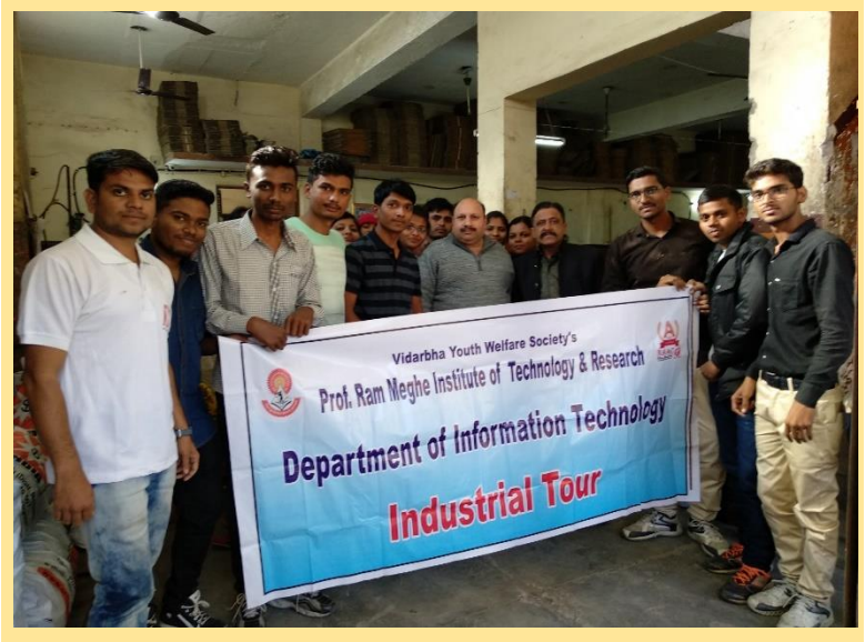
Visit at Star India Pvt. Ltd. Chandigarh