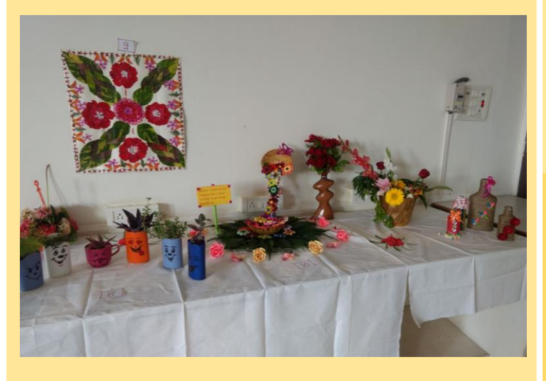
Flower Decoration Created by Students

Every Moment and Every Event of Every Man's Life on Earth Plants Something in His Soul