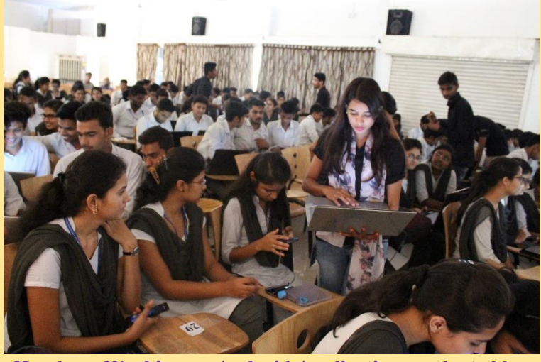
Hands on Working on Android Application conducted by students.