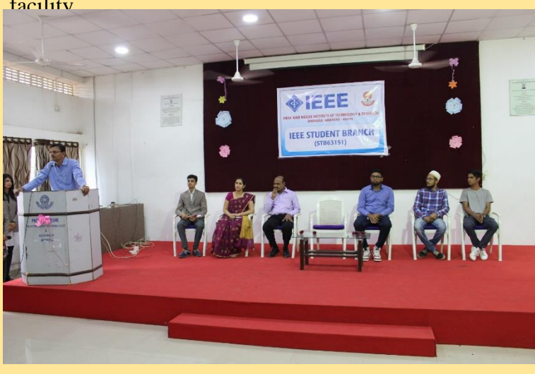
Ingurgitation Ceremony of Android workshop