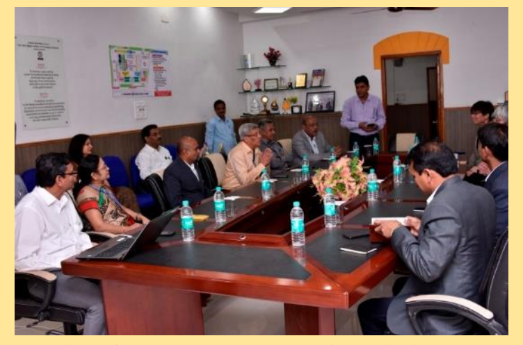
Meeting of Japanese Delegates with Principal, Head, Dean

The visiting delegations expressed joy and satisfaction at the ongoing work and progress of the institute.