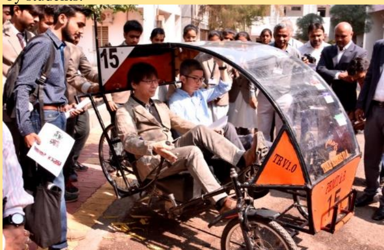
Demonstration of new model of Bicycle created by Students

The visiting professors visited various departments to have a close look at the projects on display & presented by students.