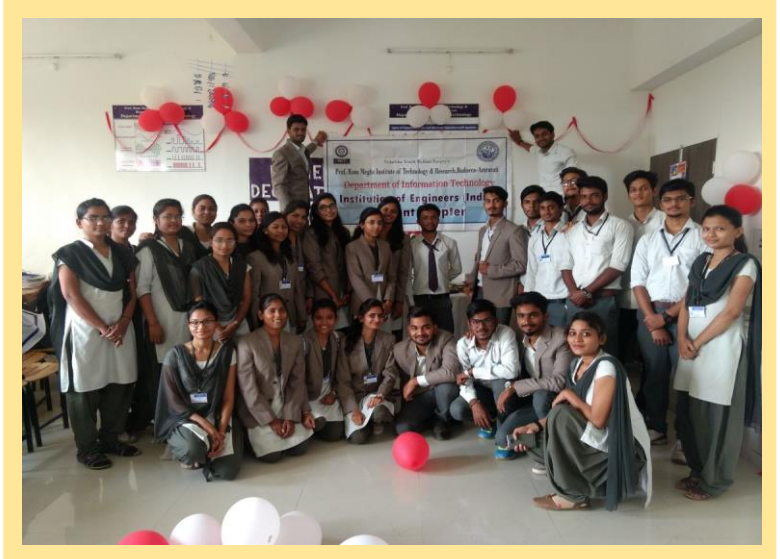
Students Coordinators of Flower Decoration & IT Showcase

Event inaugurated at the hands of one of the parent and HOD in presence of parents, students and all faculty members. Program got huge response from students. Student participated in flower decoration competition which is evaluated by judges. Students also showcased their sketches and collection of various things. Parent appreciated the creativity of students and enjoyed the program a lot. Department regularly arranges such type of programs to motivate and appreciate hidden talent in students.