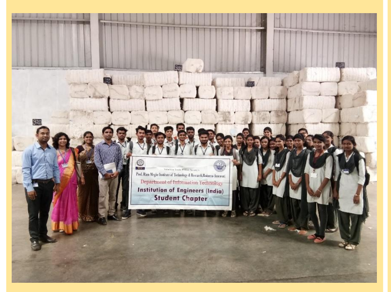
Students Visit at Suryalakshmi Textile Pvt. Ltd. at Nandgoan Peth MIDC, Amravati

It was very nice experience for all students as it was not related with their studies but everything is done by automated machines and humans only required to monitor the machine. It is highly automated cotton plant with modern machineries.